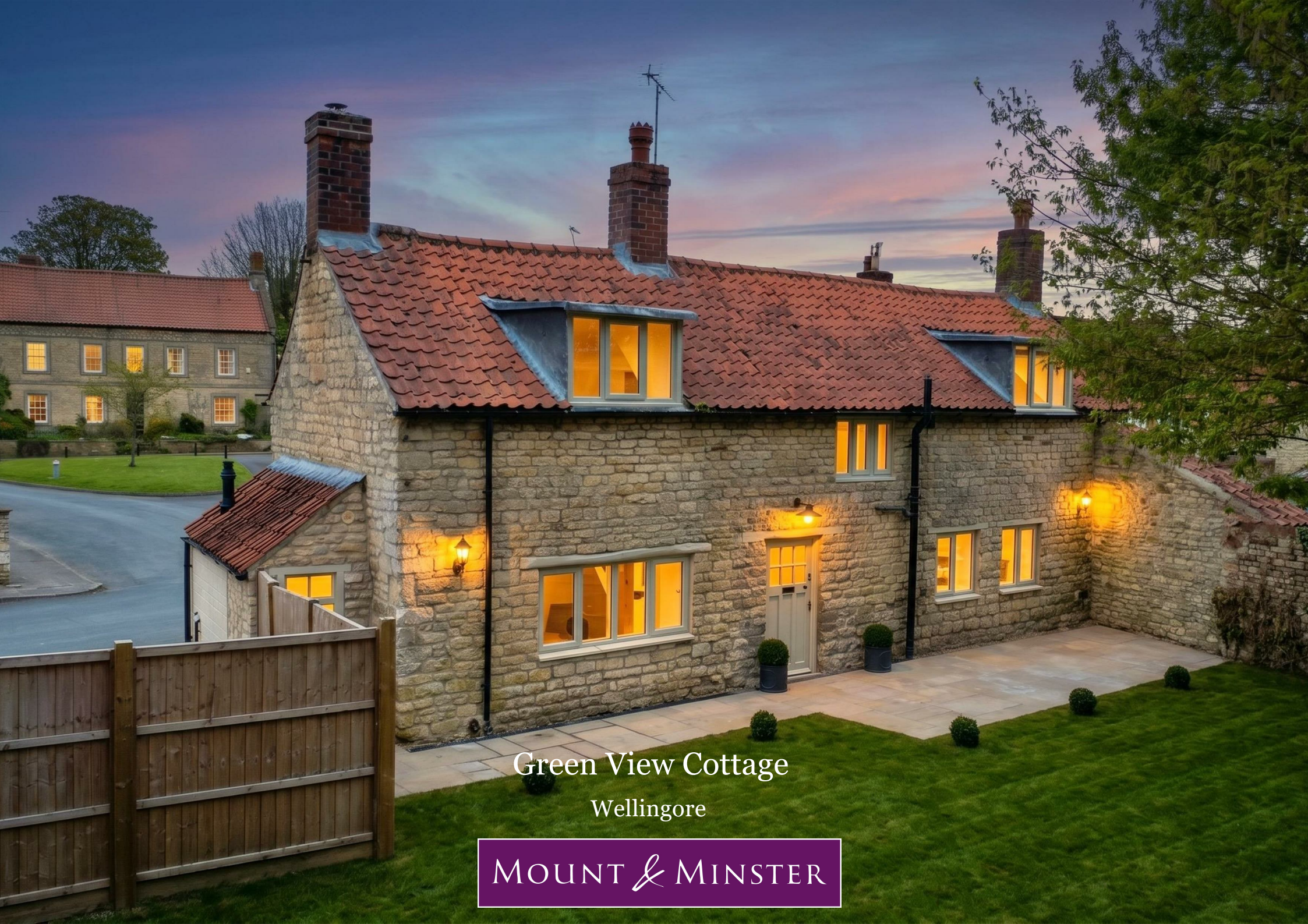
Green View Cottage Wellingore